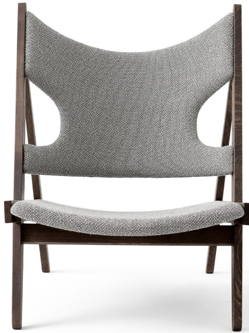
Colline 118 / Dark Stained Oak 9680079