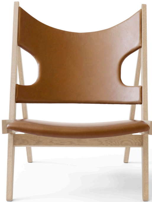
Dakar 0250 / Natural Oak 9681979