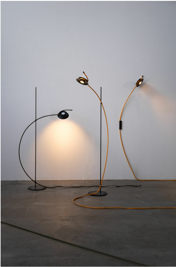
Ms. Bowjangles ANNA BOCH, DAVID ENGELHORN, 2023

The characteristic arch that gives Ms. Bowjangles its name is created by a spring steel rod covered with coloured fabric. The orange or olive green rope, which seems to climb effortlessly up a 1.40 metre high support rod, wraps around an elegant black metal shade. It appears as if the shade is held in place solely by the twists of the rope. The asymmetrical silhouette interacts dynamically with the support rod, creating clear lines and curves in the design of Ms. Bowjangles. With the black clamp mount, Ms. Bowjangles can be mounted on the wall without a base. An additional base plate with a rod turns it into a floor lamp. Both versions are very easy to adjust in height and can be moved to where the light is needed in just a few simple steps. A touch sensor at the top of the rope allows the light to be switched on and dimmed.